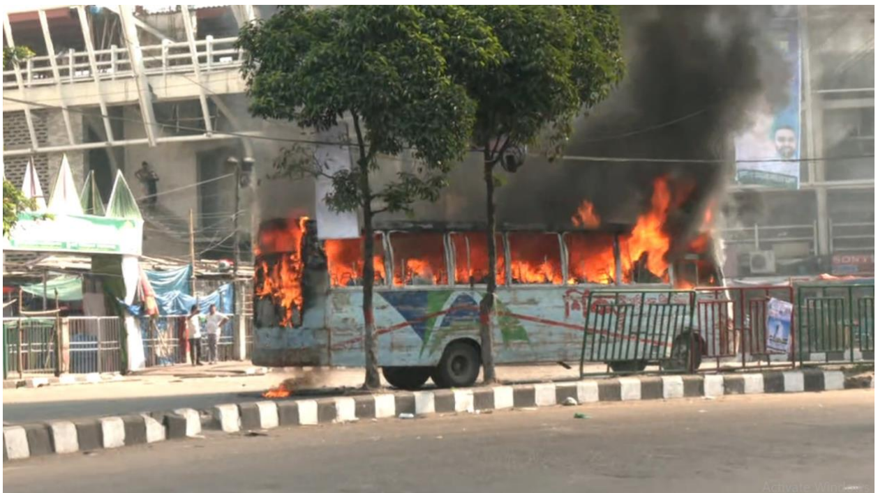
Bus set on fire in front of Baitul Mokarram on 29 Oct 2023