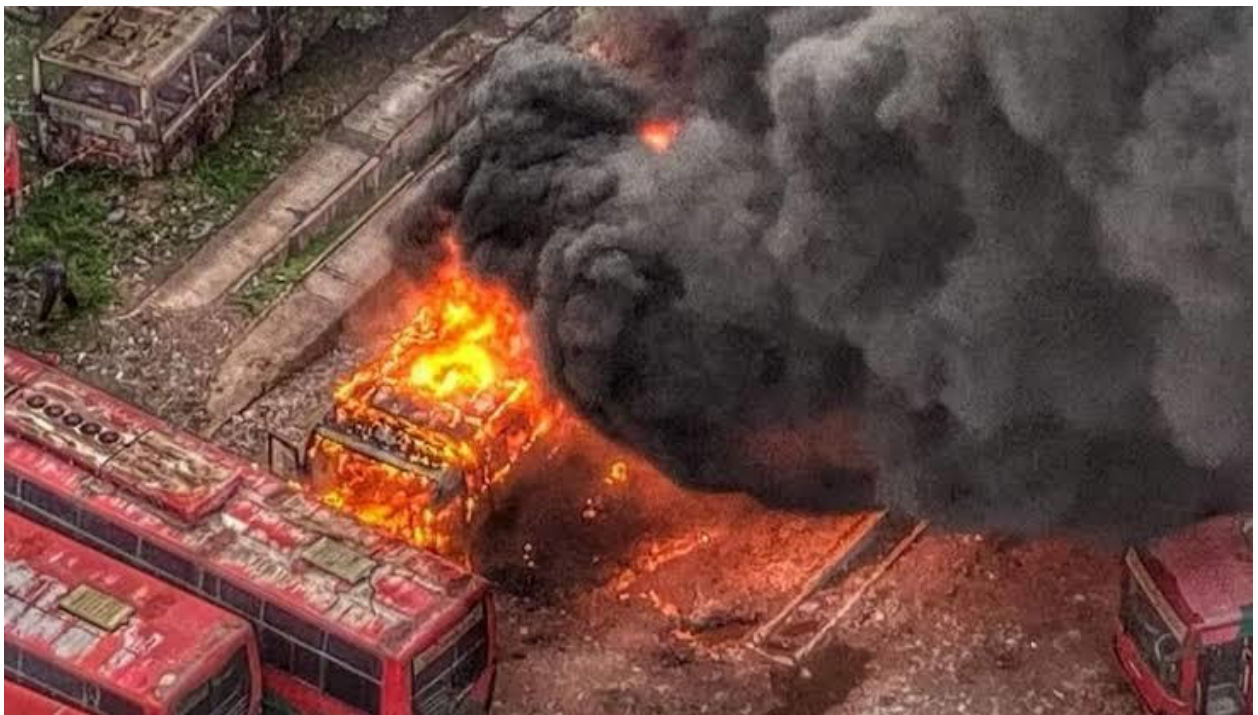
Fire on Kamlapur bus depot on 28 Oct 2023