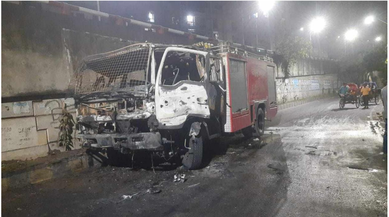
A fire service vehicle set on fire on 28 Oct 2023