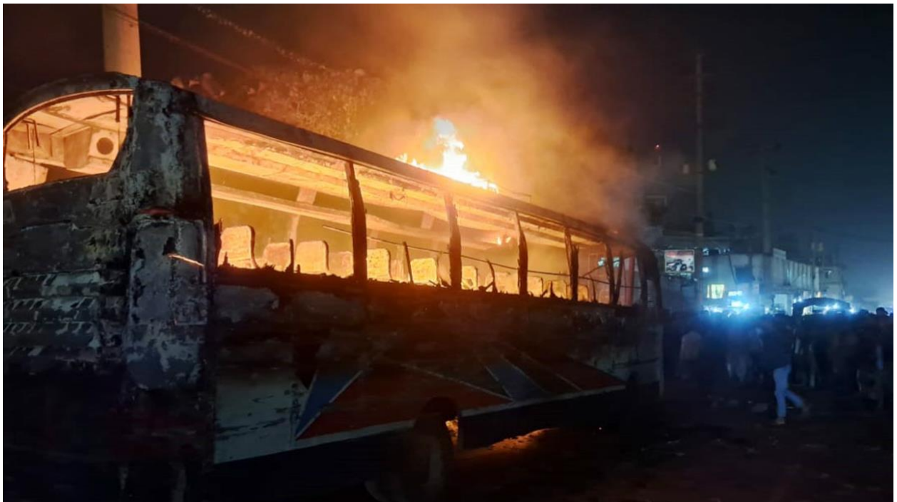
A bus set on fire in Savar on 28 Oct 2023