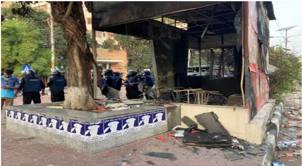
Police box vandalised on 28 Oct 2023