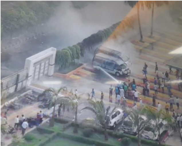
Attack in central police hospital on 28 Oct 2023