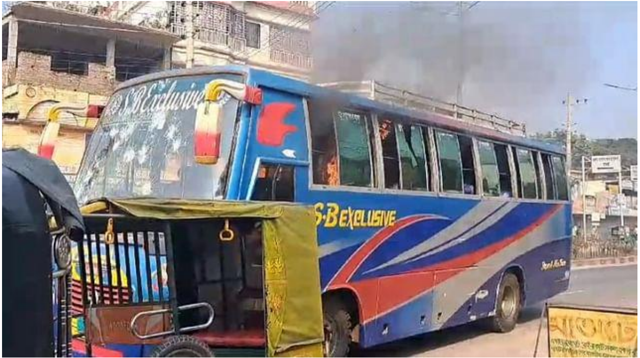
A bus damaged by fire in Magura on 29 Oct 2023