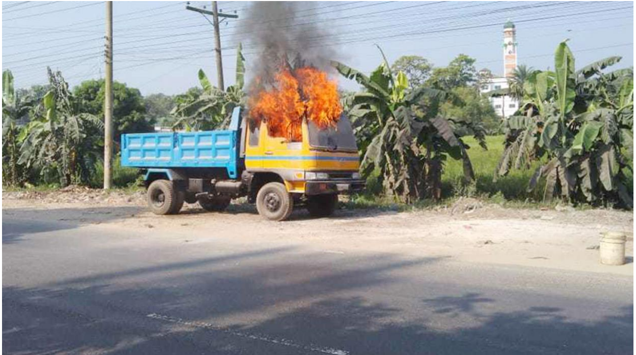
Rogue set fire on a pick-up van in Dhaka-Mymensingh highway on 29 Oct 2023