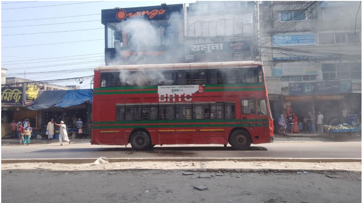
A BRTC bus set on fire in Gazipur on 29 Oct 2023