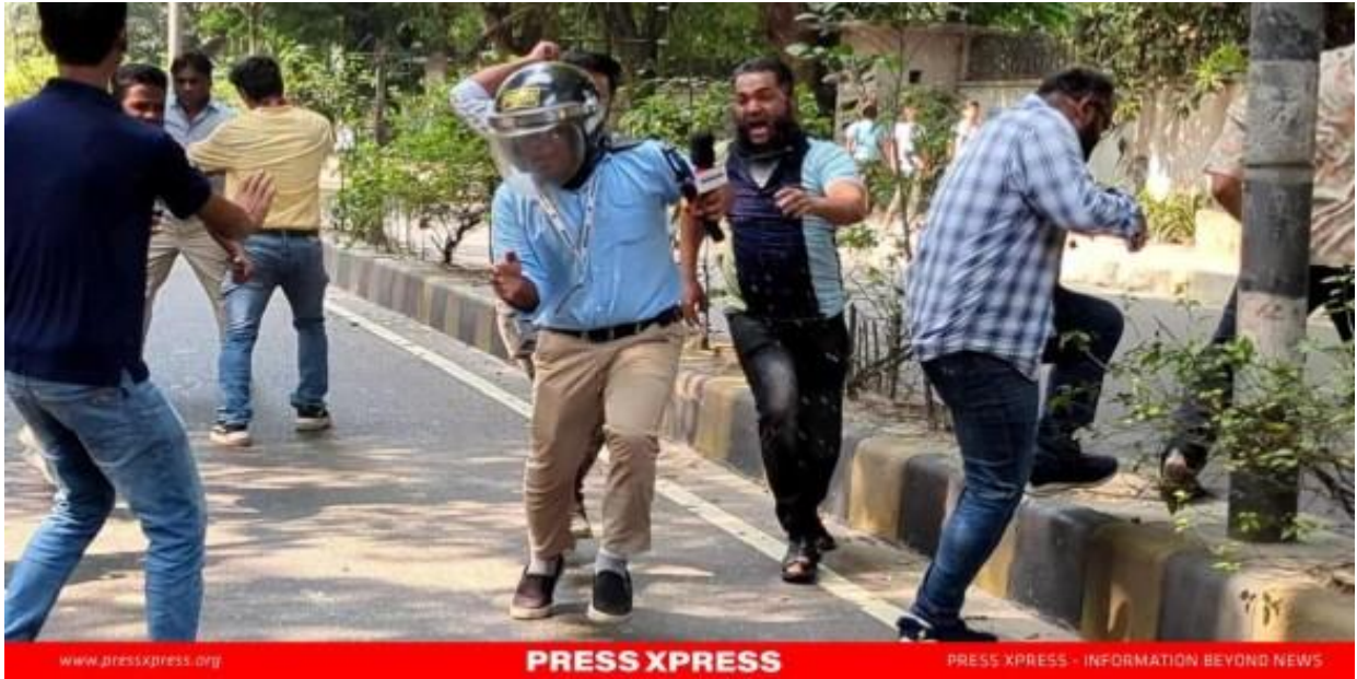
Attack on media personnel on 28 Oct 2023