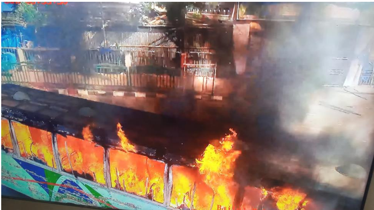
A bus conductor was burned alive inside a bus in Demra, Dhaka on 29 Oct 2023

In Manikganj, miscreants set a Dhaka-bound passenger bus on fire at the Tara Bridge area of Sadar upazila on the Dhaka-Aricha highway during hartal.