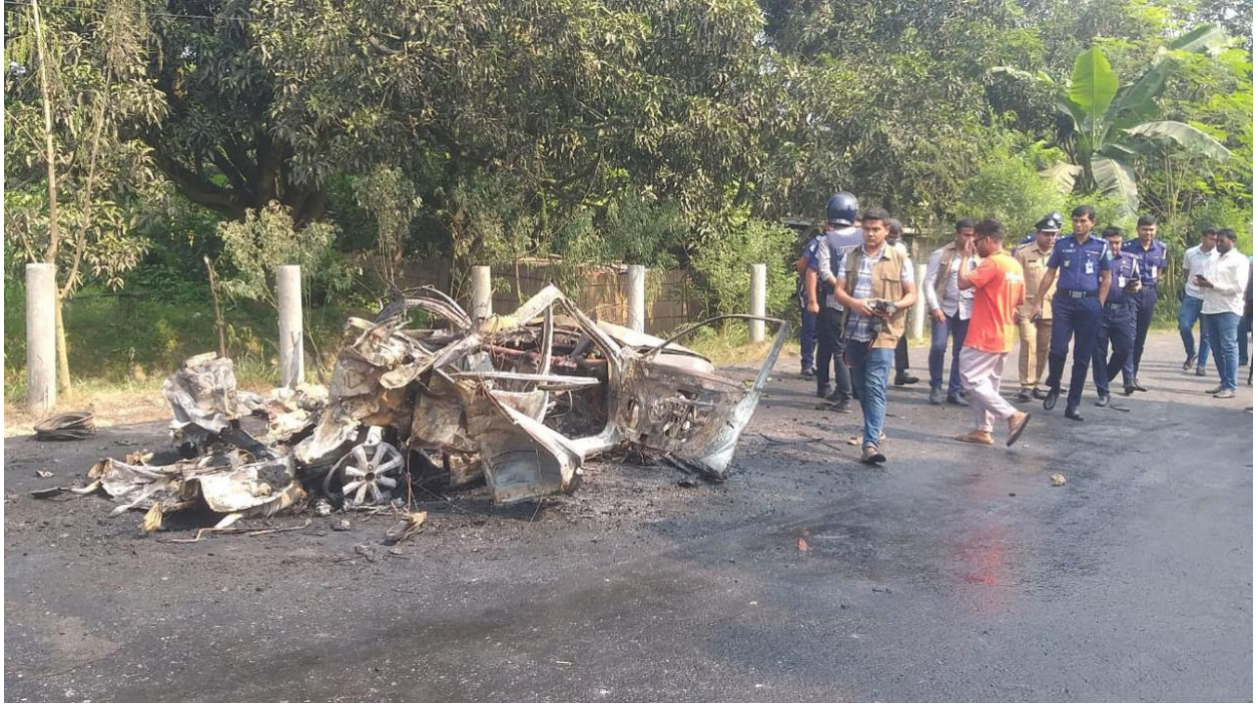
A private car damaged by fire in Bagha, Rajshahi on 29 Oct 2023