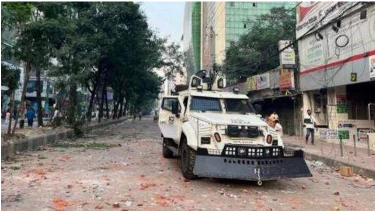
Attack on a police van (28 Oct 2023)