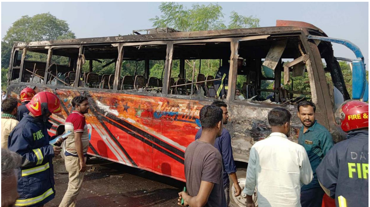
A bus set on fire in Dhaka-Mymensingh highway on 29 Oct 2023