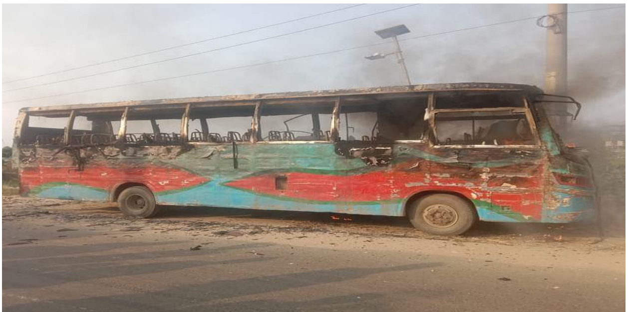
A bus damaged by fire set on by BNP activists in Keraniganj on 29 Oct 2023