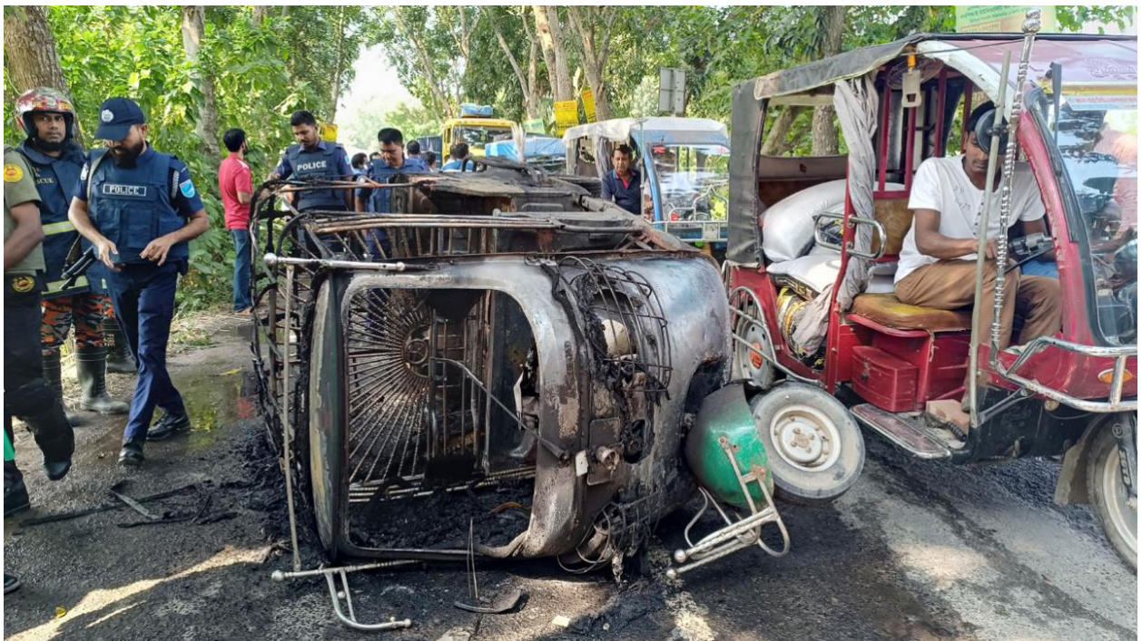
Vandalism in Manikganj on 29 Oct 2023