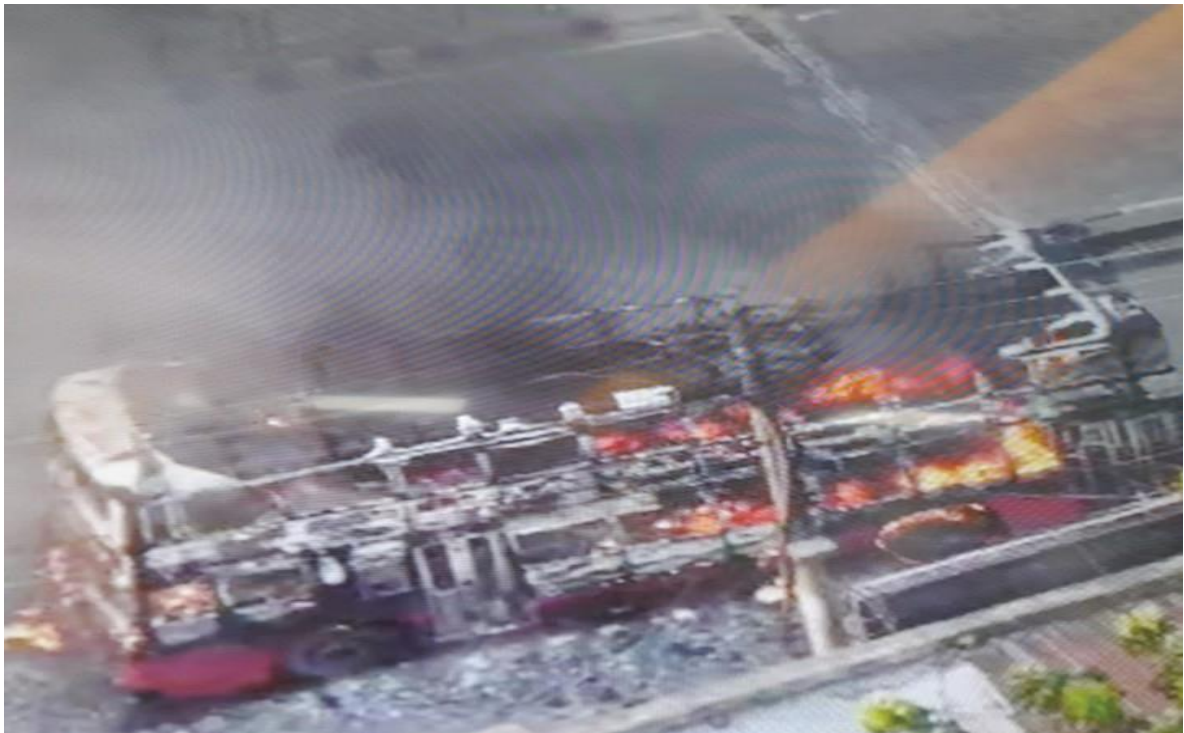
Atrocity in Rajarbagh on 28 October 2023