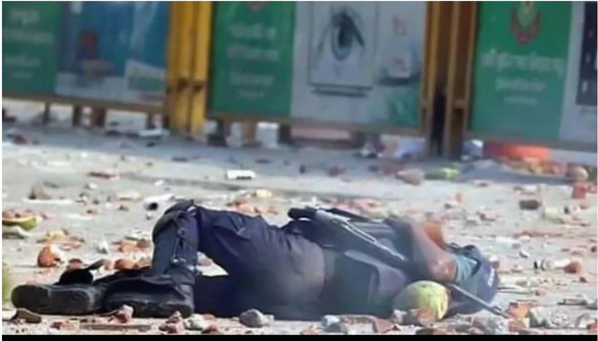
A Police official attacked and murdered by the BNP activists on 28 Oct 2023