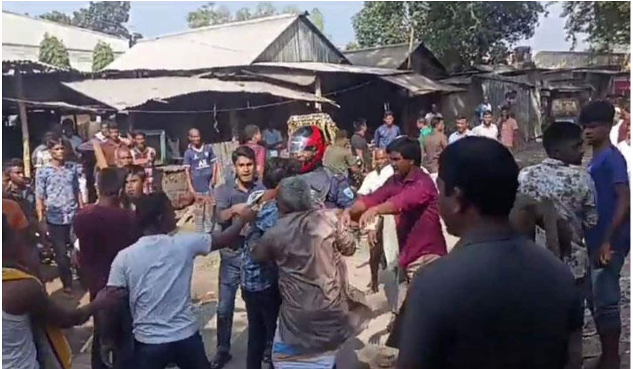
A Jubo League leader was killed in Lalmonirhat on 29 Oct 2023