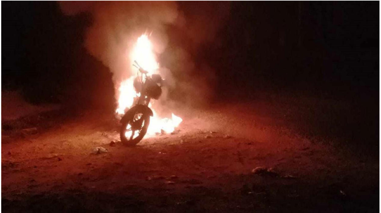
Cocktail explosion on a motorcycle in Gazipur on 28 Oct 2023