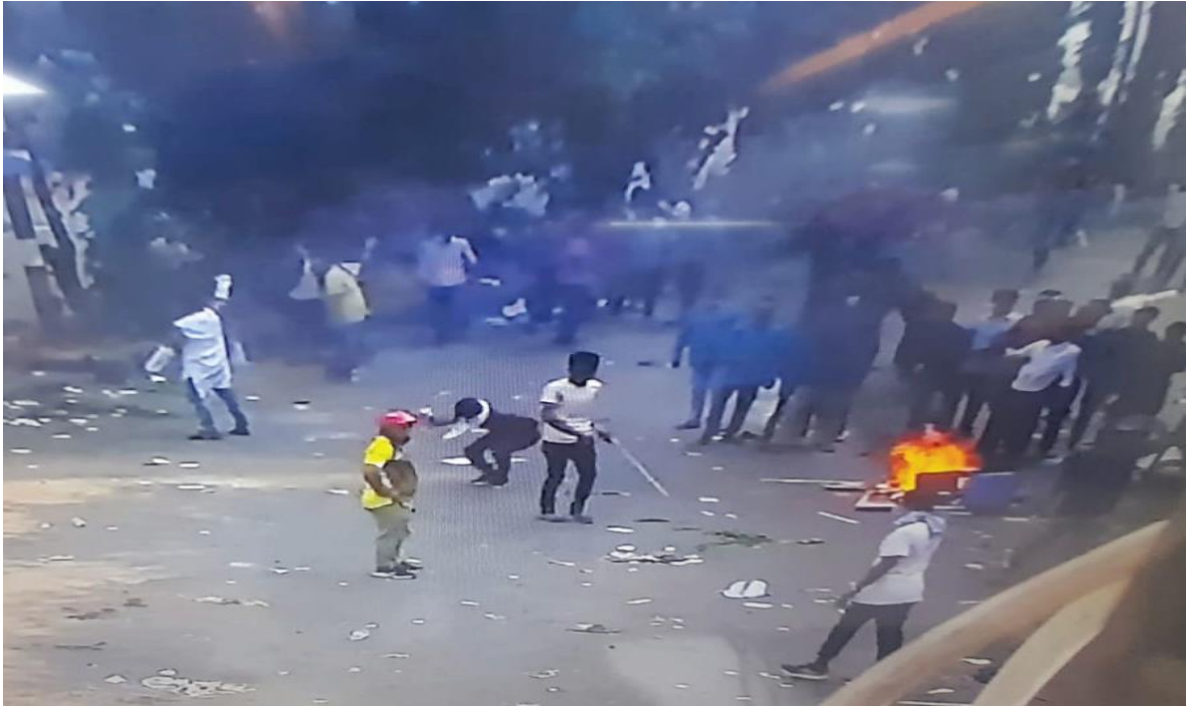
Cocktail explosion at Nightingale Square on 28 Oct 2023