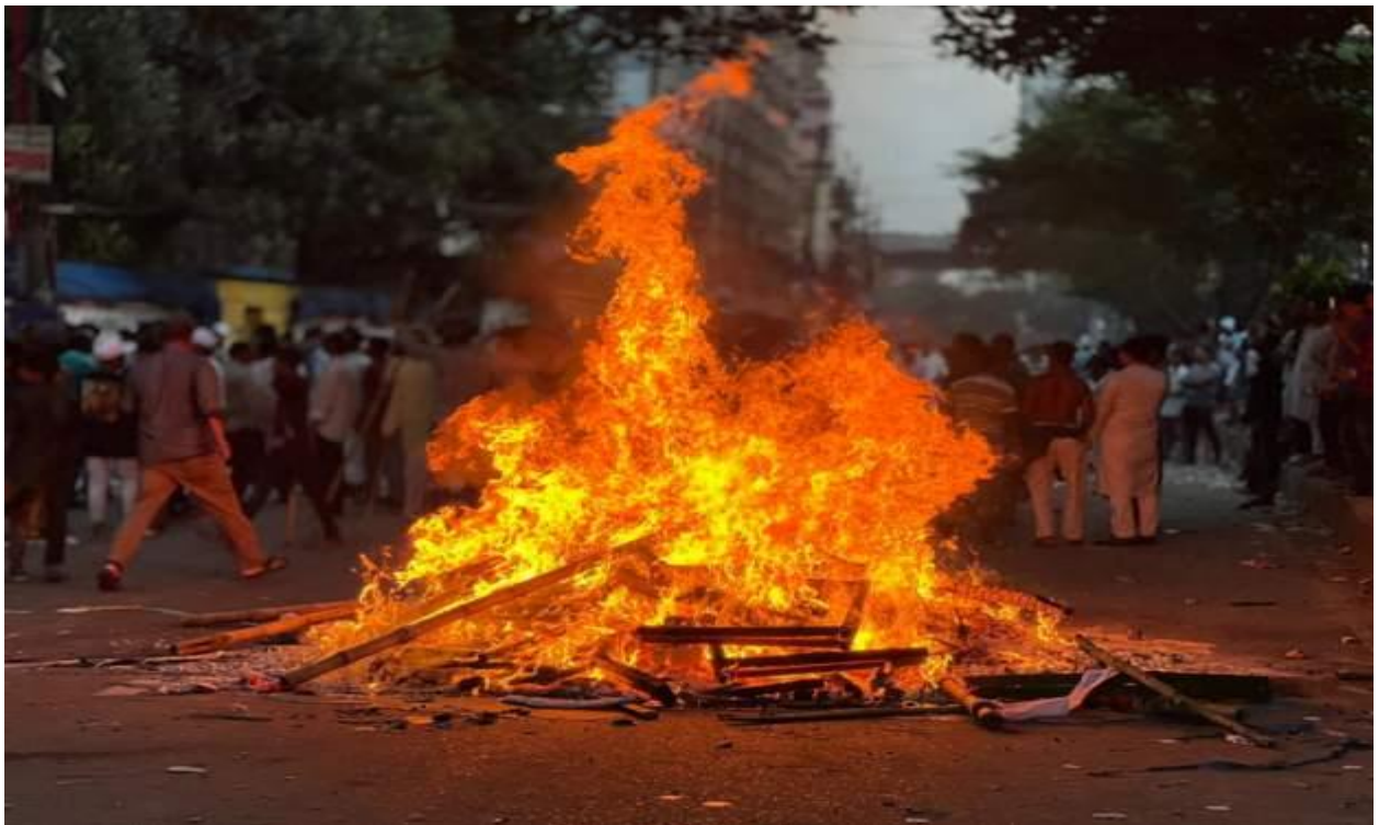
Violence by BNP in Dhaka on 28 Oct 2023