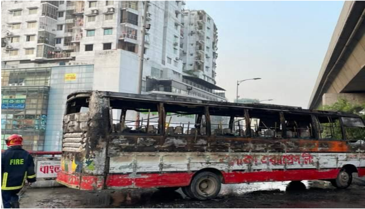
A bus set on fire in Mouchak on 29 Oct 2023