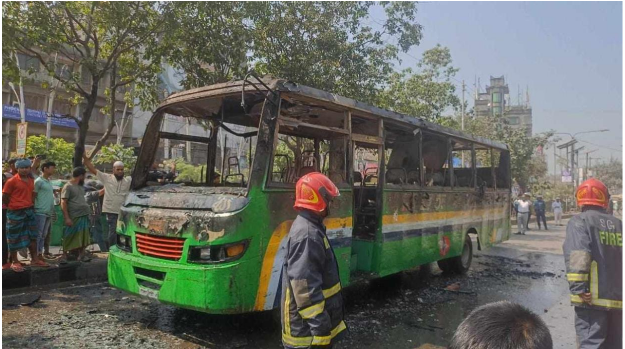
A bus set on fire in Tatibazar on 29 Oct 2023