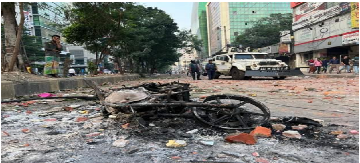
Motorcycle set on fire in Dhaka on 29 Oct 2023