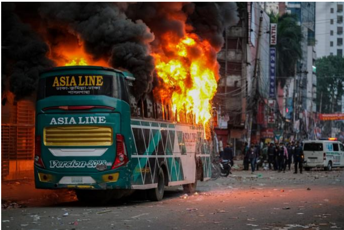
Passenger bus set on fire on 28 Oct 2023