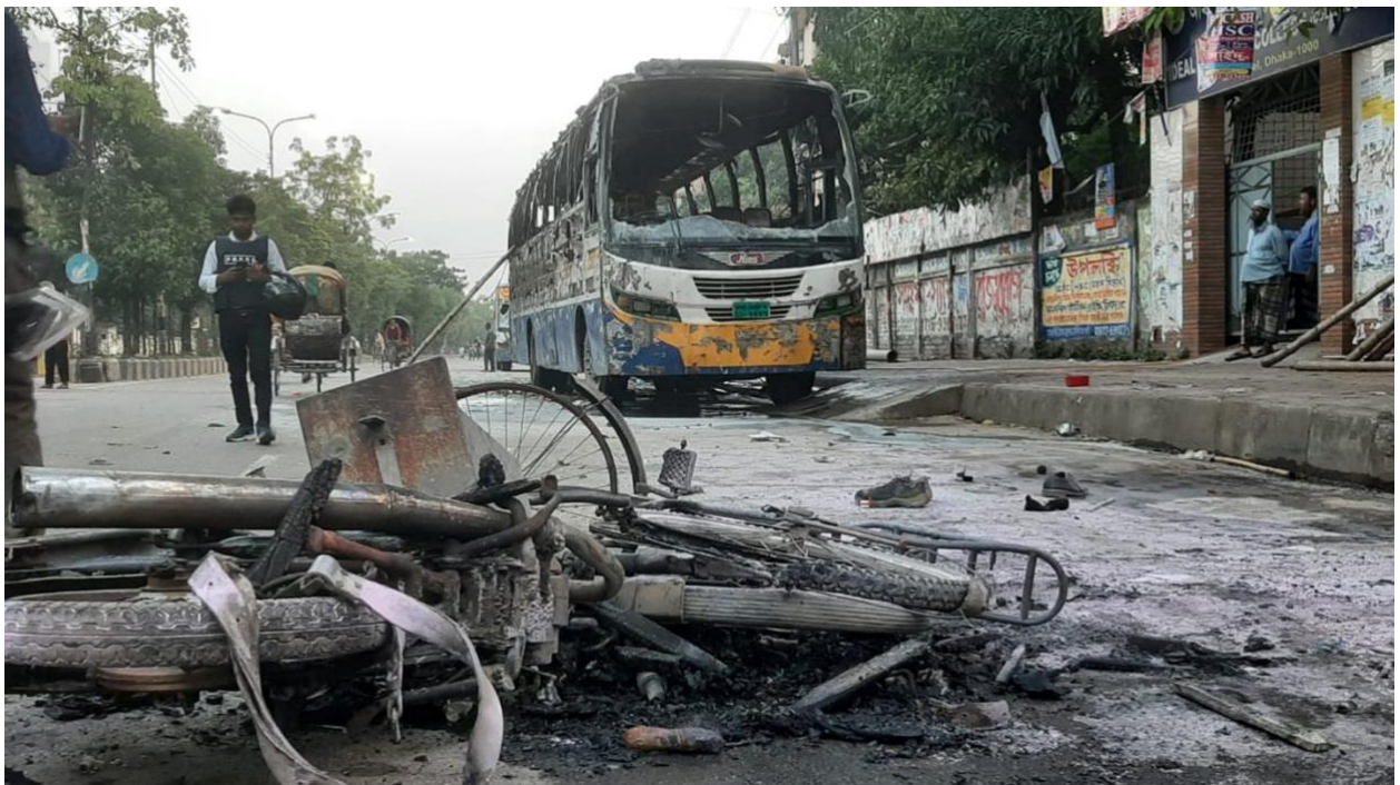
Bus and cycles damaged by fire set on by the BNP activists in Dhaka on 29 Oct 2023