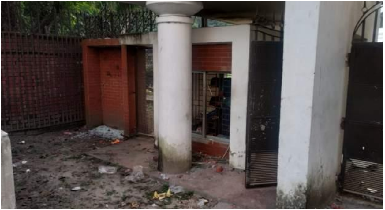
Attack on the residence of Hon'ble Chief Justice on 28 Oct 2023