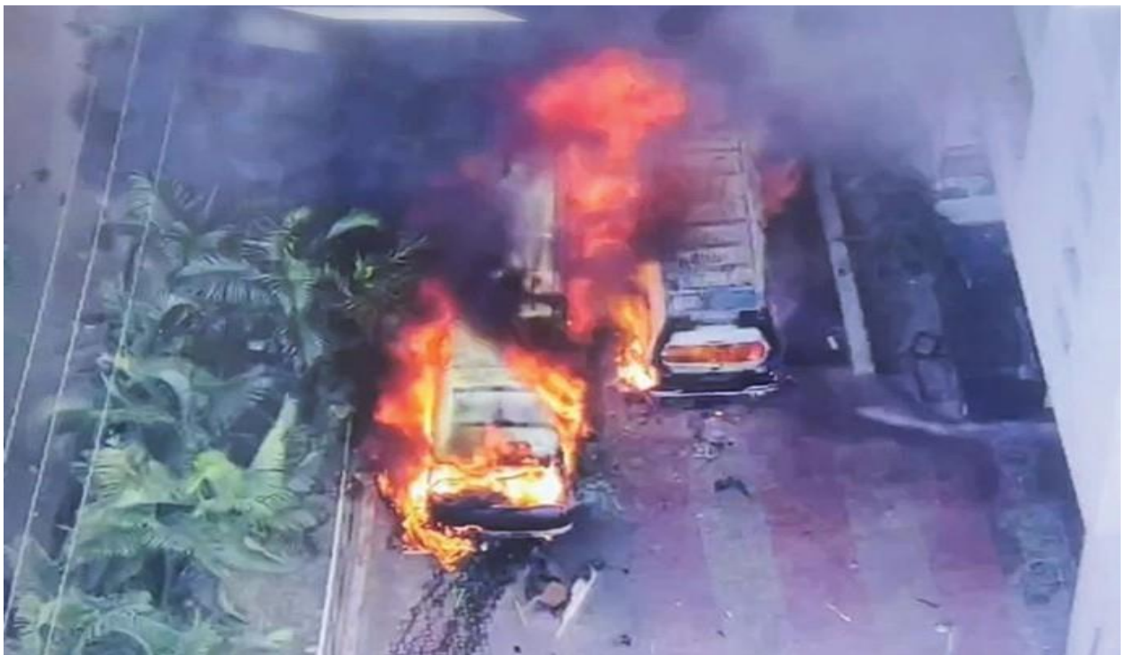
Explosion and attack in Kakrail on 28 Oct 2023