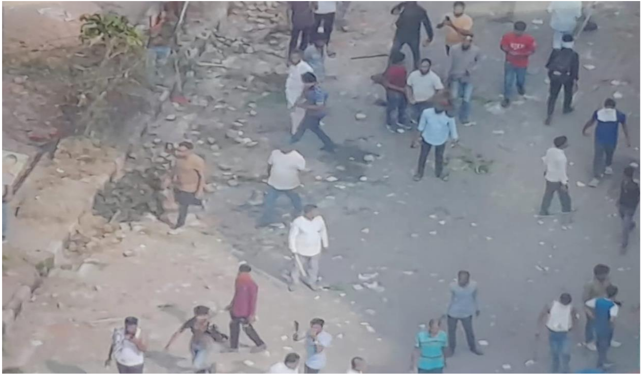
Vandalism by BNP activists in TNT Colony on 28 Oct 2023